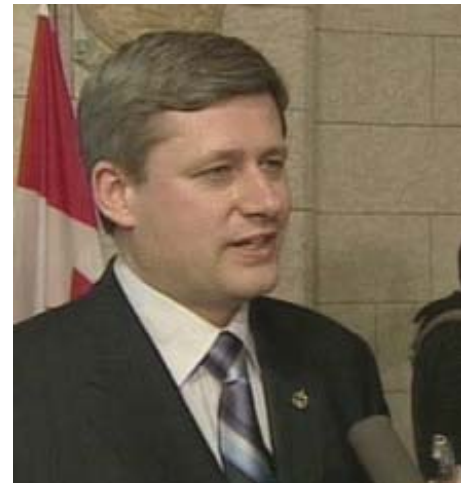
Canadian Prime Minister Stephen Harper