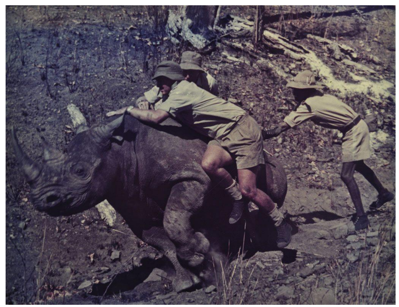
Relocating wildlife to national parks was all in a day's work in my youth. Despite being darted with tranquilliser, this black rhino still managed to run for a mile!

The elephants of Africa occur in 37 countries, or "range states", and form 150 distinct populations. The habitats vary widely, including montane forests, deciduous forests of many kinds, savannah (treed grasslands), grasslands, thornveld, dry bushveld, teak forests, swamps, and true deserts. The rainfall in these different habitats varies from practically no rainfall at all to over 200 inches a year. Their interactions with humans are sometimes hostile – both ways – and sometimes docile. Some are poached, others are not poached. And the natural environmental pressures that each population has to endure due to variances in vegetation type, altitude, temperature and rainfall, are never the same. Consequently, the management needs of each of these populations have to be assessed on their own merits, and a management strategy, that is entirely focussed on one population at a time, has to be applied.