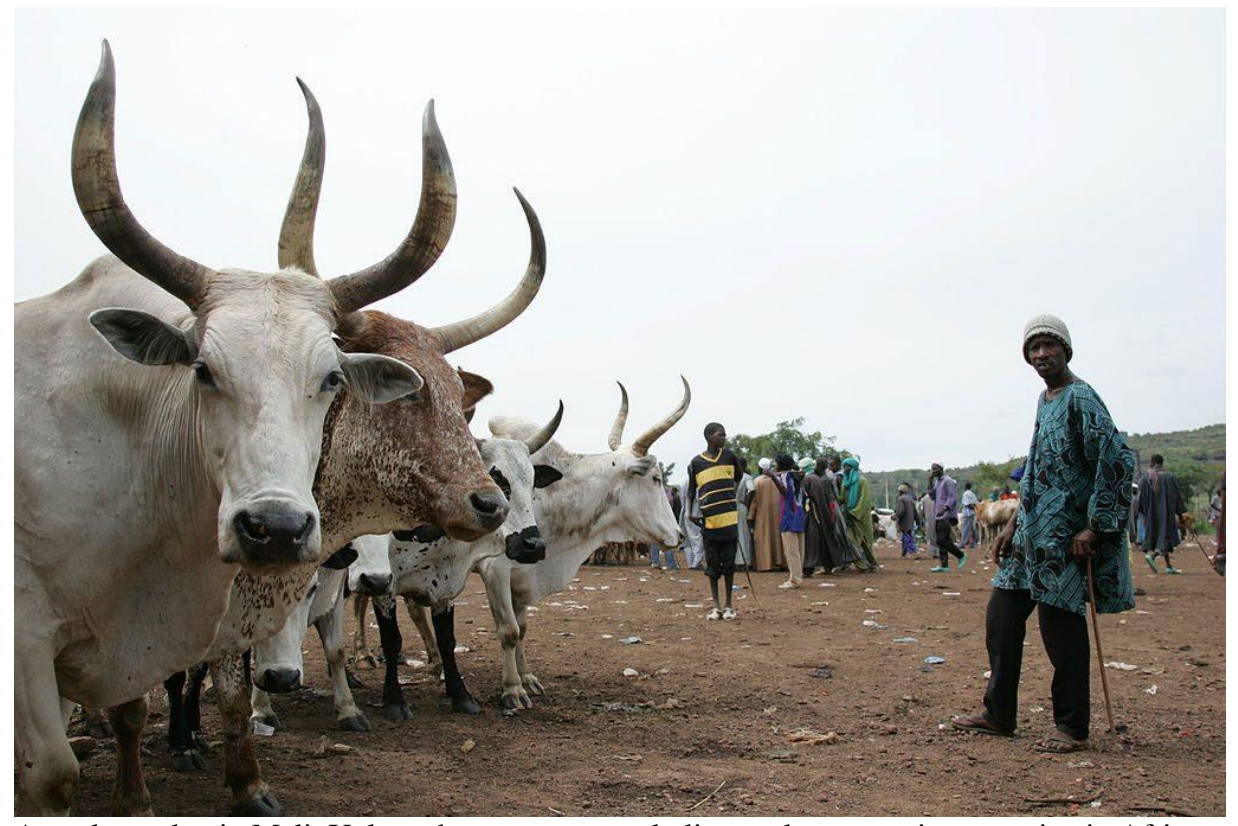
A cattle market in Mali. Unless change comes, only livestock are certain to survive in Africa because rural people cannot afford to have them become extinct.

There is a human population explosion in Africa, and the realities are as follows. There were 95.9 million people living in sub-Saharan Africa in the year 1900. By 2000, that number had increased to 622 million. And if the same rate of population increase continues throughout the 21st century, there will be over 4 billion people living in this same region by 2100. And they will all be trying to eke out a living from this finite continent, with its finite resources.