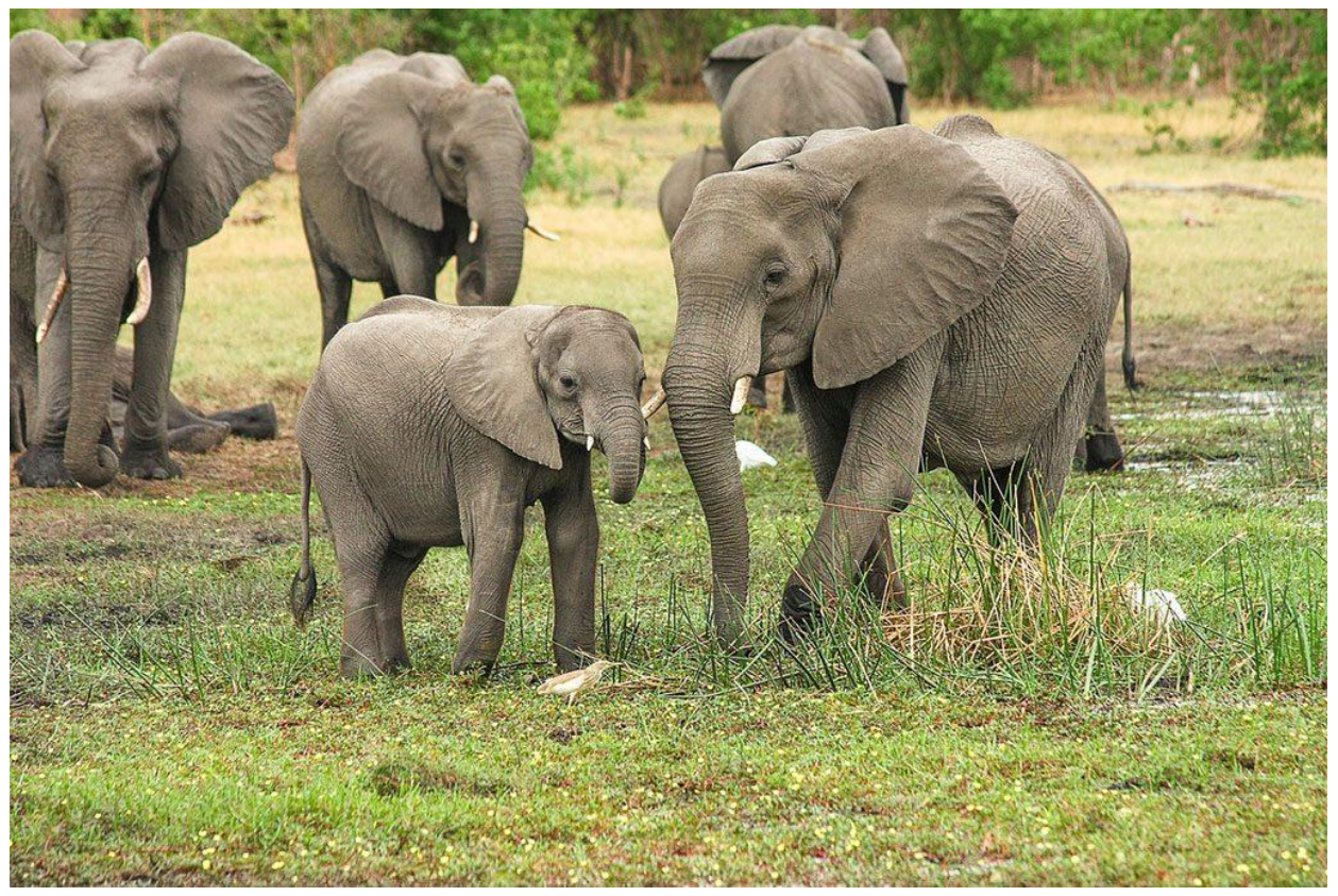
Every single elephant population in southern Africa is now grossly excessive.

Safe populations require conservation management (annual culling) to make sure they don't grow to the extent that they exceed the habitat's carrying capacity. And unsafe populations need preservation management (protection from all harm), with the purpose of helping the population to return to a safe status. Excessive elephant populations require drastic and immediate population reduction. This is for the sake of the elephants themselves, for the health of their habitats (which excessive populations totally destroy), and for the maintenance of the biological diversities of our national parks. Indeed, the first action that needs to be taken on an excessive population is to reduce its numbers as quickly as possible, by no less than 50%.