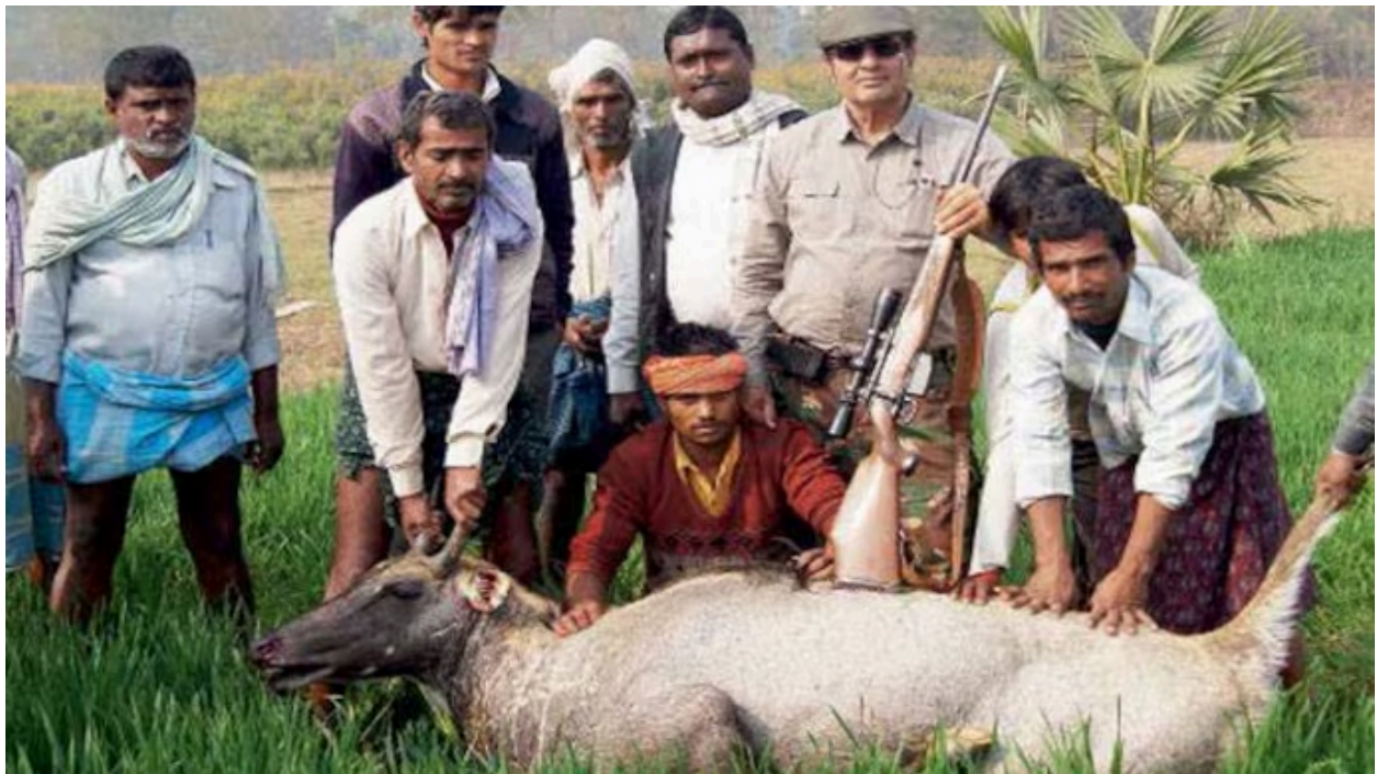
▲ Crop-raiding wildlife such as nilgai and wild boar cause significant agricultural losses across India, yet the resulting off-take is rarely channelled into food systems.

India may be the most frustrating case of all. The government publicly acknowledges that farmers across India have suffered increasing crop losses from wild animals including wild boar, nilgai, deer, monkeys, and elephants. The Wildlife (Protection) Act allows the central government to declare certain Schedule II animals vermin in a defined area for a defined period. India already recognises the conflict problem and already has legal tools for exceptional management. What it does not have is a serious, national conversation about whether lawful off-take in some contexts could ever be channelled into inspected, traceable, socially useful protein rather than pure waste.