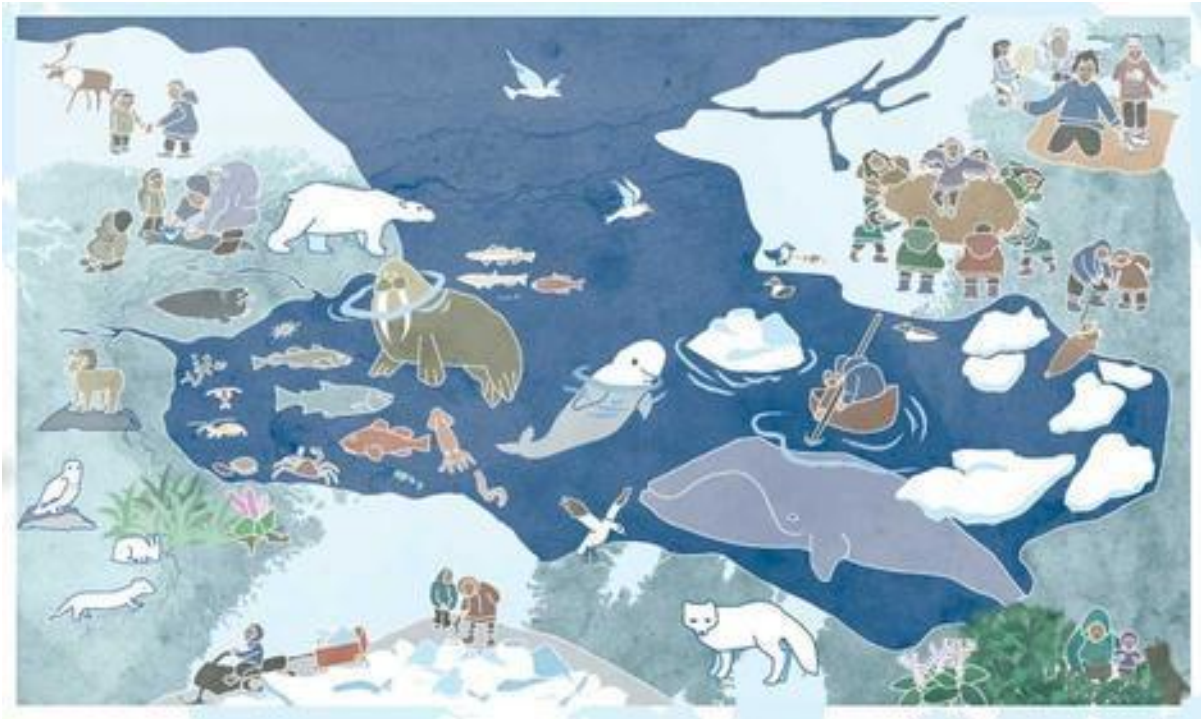
▲ In Arctic regions, marine mammals remain a critical traditional protein source supporting food security in remote communities.

A serious food-security debate cannot simply erase culturally rooted, legally regulated marine use because urban activists elsewhere find it emotionally inconvenient. The conversation should be about sustainability, food safety, community rights, and management quality — not about pretending these food systems do not exist.