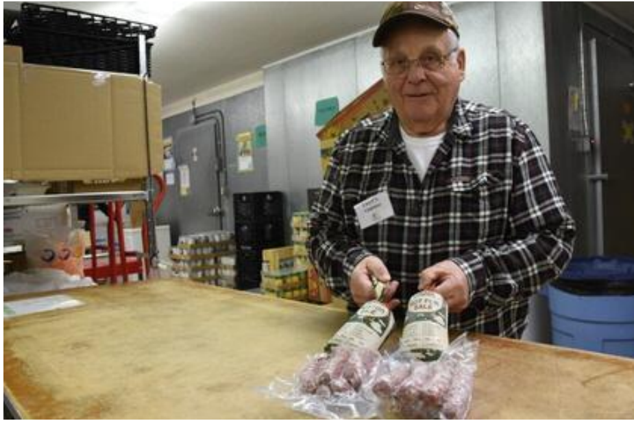
▲ Programs like Hunters Sharing the Harvest and Farmers and Hunters Feeding the Hungry convert legally harvested deer into protein for food banks.

That is not symbolism. That is a functioning pipeline: legal harvest, inspected processing, distribution through community food networks, and real protein reaching people who need it. It also destroys one of the laziest caricatures about hunting. Sustainable use is not only about recreation, trophies, or commerce. It can also be a hunger-response mechanism when institutions bother to build the bridge between harvest and need.