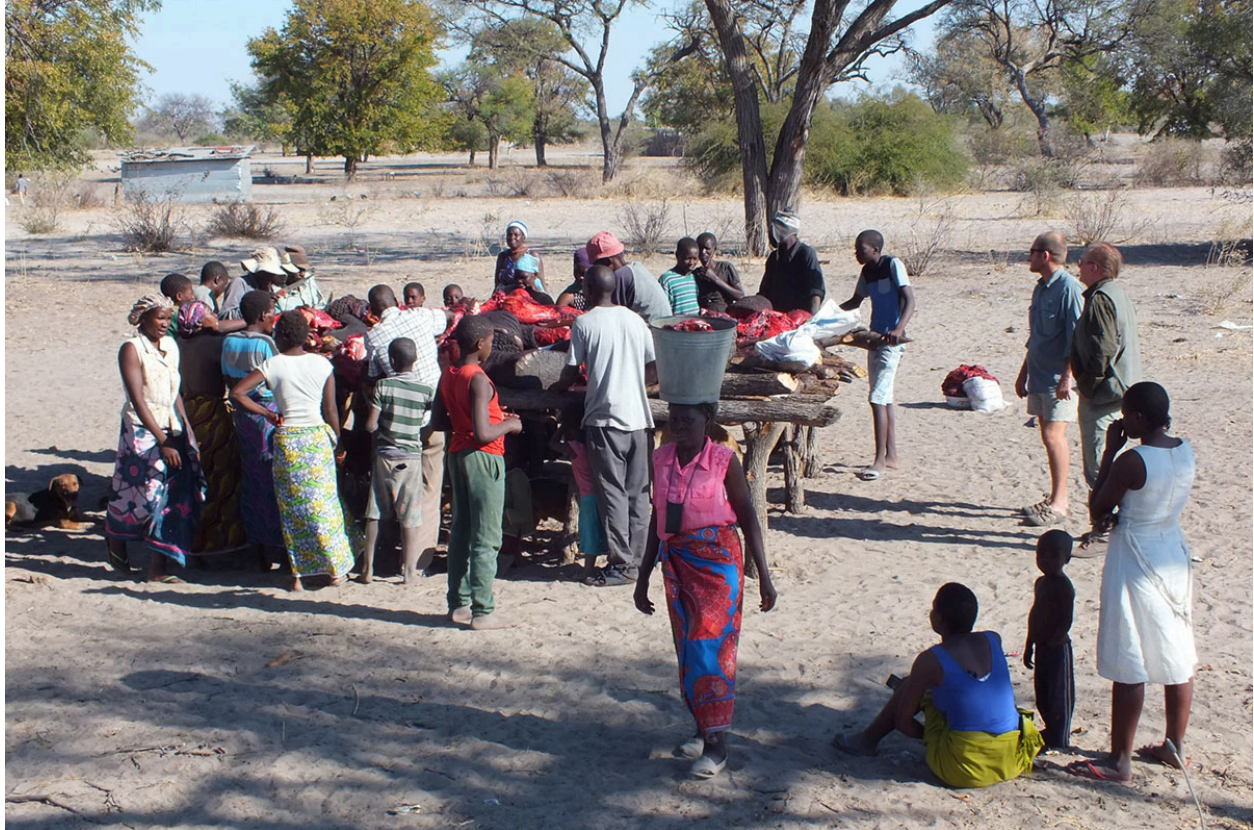
▲ Community conservancies in southern Africa often distribute game meat from regulated hunting to rural households.

Southern Africa offers a different but equally important lesson. In Namibia's communal conservancies, meat distribution is not a fringe extra; it is part of the benefit structure of community conservation. The 2022 State of Community Conservation report says conservancy residents received 317,898 kilograms of game meat from hunting, and explicitly links game meat provision to household food security. During the 2024 drought emergency, Namibia's Ministry of Environment, Forestry and Tourism said 723 animals would be contributed to the government drought-relief programme, with 56,875 kilograms of meat already delivered.