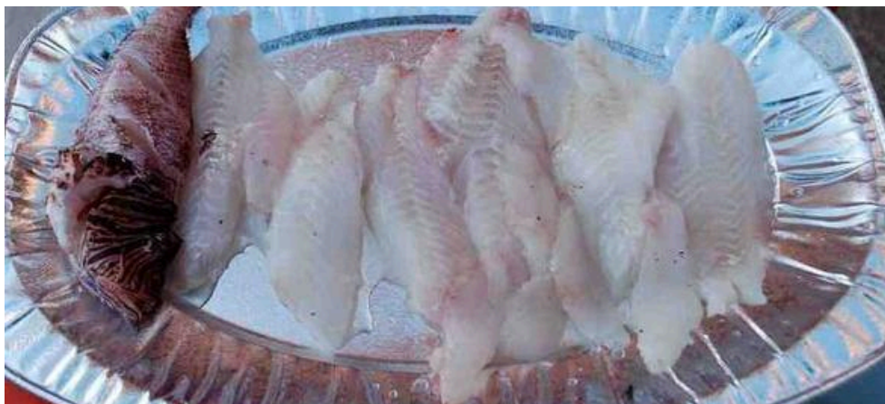
▲ Lionfish removal in the Caribbean has increasingly been paired with seafood markets promoting the invasive species as food.

Marine systems offer another good example. NOAA has been blunt on invasive lionfish: “If we can’t beat them, let’s eat them.” NOAA says an invasive lionfish food-fish market is practical, feasible, and should be promoted. That matters because lionfish are not just a nuisance; they are a reef predator harming native fish communities in U.S. Southeast and Caribbean waters. Here, removal and food use are not in tension. They reinforce each other.